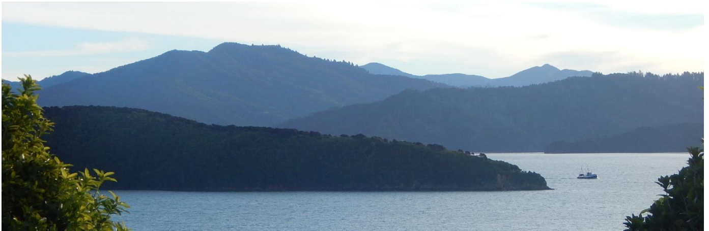
Te Pahoahoa ('the Snout') as viewed from Karaka Point