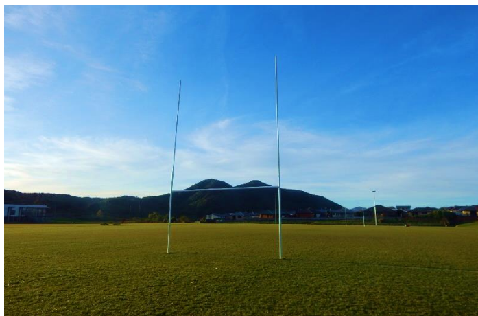
Endeavour Park sports fields with Victoria Domain in the background

Once the initial feedback period closes, a draft management plan will be prepared. From this, there will be a more formal opportunity for you to provide written submissions and present these to a hearings panel if you wish. We are more than happy to come and discuss with groups the review process and your ideas for how you would like to see the Victoria Domain area managed.