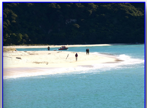
Scenes of Awaroa Beach